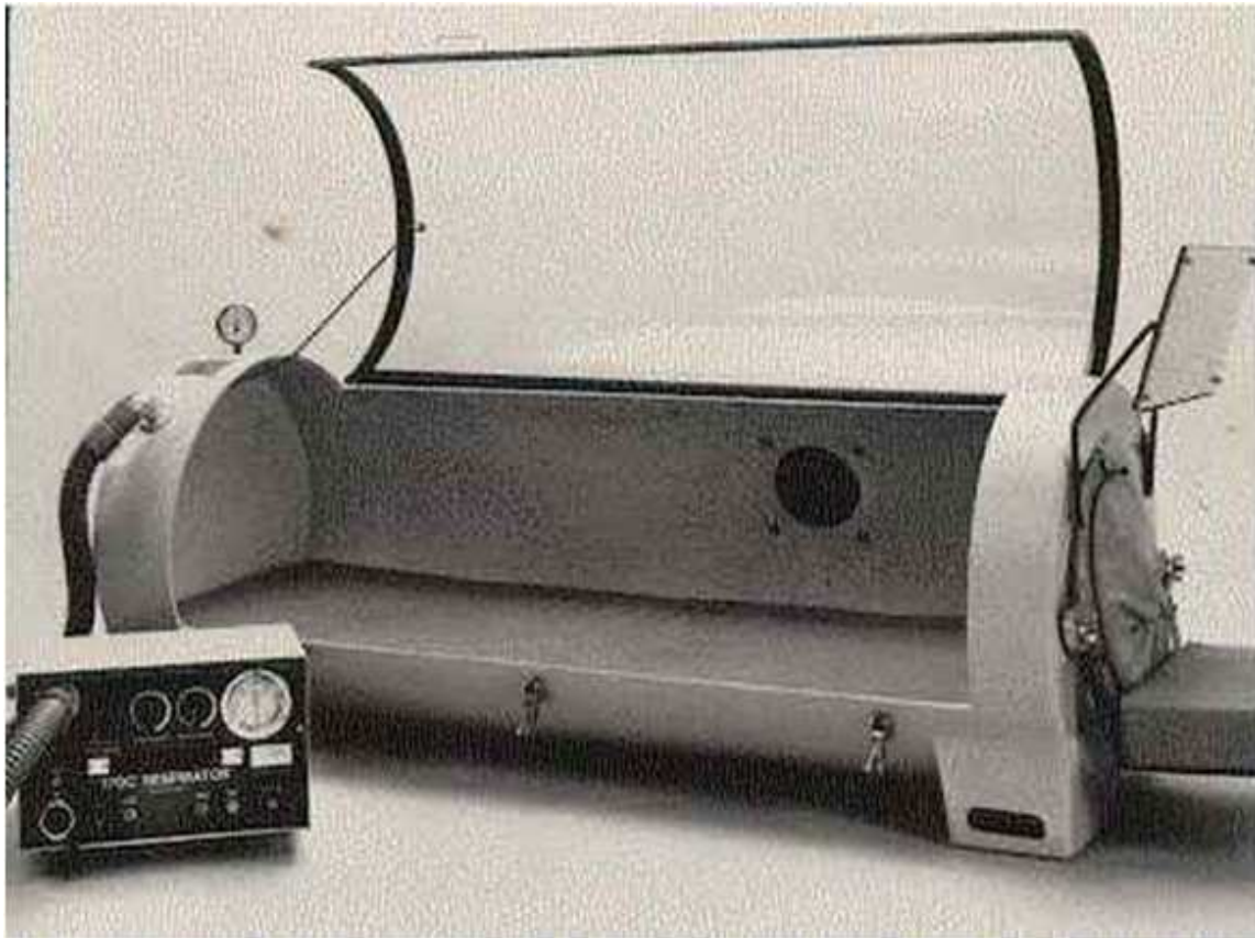
Figure 2: The iron lung the apparatus used to produce artificial ventilation by producing a negative pressure around the chest and abdomen while the face is exposed to the atmosphere, which helped to draw air to the lungs. Obviously it was difficult to nurse the patients, but nevertheless some patient spends their life within it and they were able to speak, eat and even watch television. {Atkinson history of anesthesia symposium London 1987}(2a, 2b)