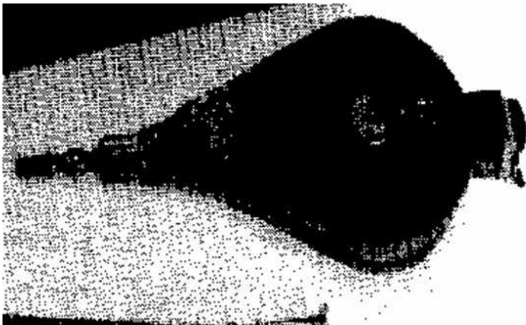
Figure 1: The bellows used to blow air in order to start a fire. Saleh Ibn Bouhlah and Royal Human Society used similar bellows and Royal Society for resuscitation of drowned persons (Al Jasser 1987)

So did the Society of resuscitation of drowned person 1769, and the Royal Human Society 1776 in efforts to resuscitating the drowned apparently dead. Automatic artificial ventilation of the lungs during chest surgery was known since 1896. Tuffier and Hallian in France successfully intubated and ventilated the lungs by using non-rebreathing valve. Chevalier Jackson in America popularized laryngoscopy and intubation in the first quarter of the 20 th century. Cecil Drinker and his brother Philip developed a positive and negative pressure generating tank respirator and was used successfully on a child in Boston children hospital 2 . In 1948, muscle relaxants were introduced to anesthesia practice and anesthesiologists used to assist the intubated, partially paralyzed patient who had respiratory depression gained a great experience. In 1952, the polio epidemic in Copenhagen left many patient paralyzed and medical students were allocated to ventilate these patients continuously by hand (due to shortages of tank ventilators). They were using a self inflating bag and one way valve on an intubated patient. Bjorn Ibsen established the first intensive care unit in Copenhagen in 1953. The chronic patients who survived this epidemic were ventilated in negative pressure chamber "Iron Lungs" till their natural death [ Figure. 2 a., b. ].