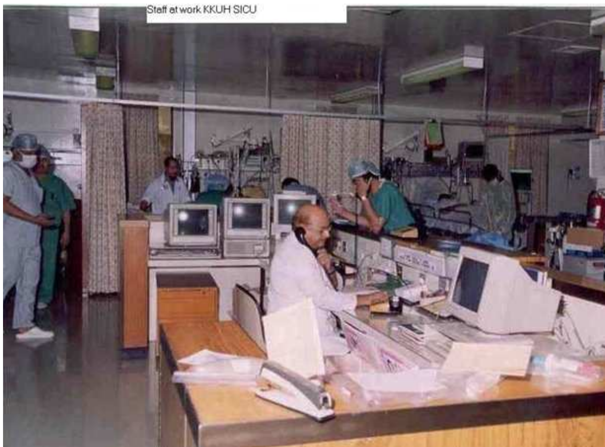
Figure 3: Various pictures, of modern intensive care unit, showing: (3a) the nursing station at KKUH, (3b) An intubated patient is ventilated, using modern intermittent positive pressure ventilation method.